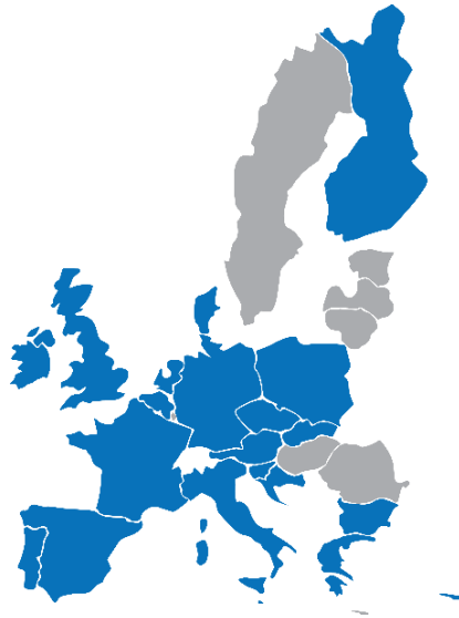
Figure 2. Evidence of criminal cases of gender-based violence in sport in EU Member States