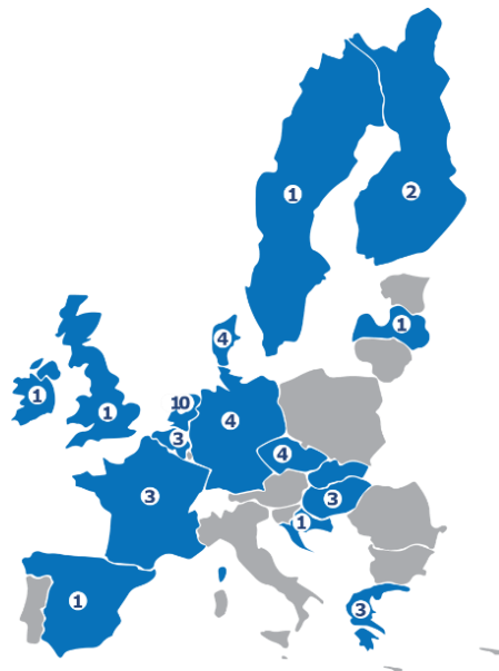
Figure 4. Overview of available research about gender-based violence in sport in EU Member States 73

National researchers identified a total of 38 studies (see Figure 4) published between 2001 and 2016 that attempted to measure (aspects of) gender-based violence in sport in one or more EU Member States. A list with the references of the identified research can be found in Annex 2.