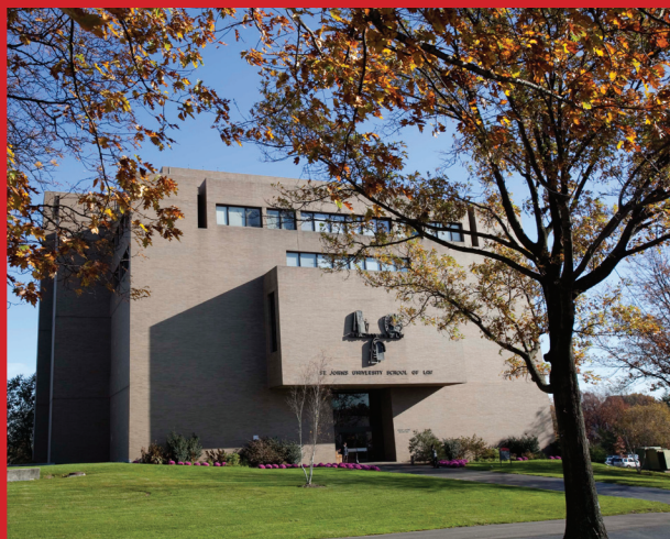
St. John's Law School

This LL.M. is a unique program of study that appeals to a special breed—American and foreign attorneys with a dedication to the practice of law and a passion for sports in all its forms. For these lawyers, our International Sports Law Practice LL.M. is a perfect choice to give them a running start in this exciting international legal specialty.