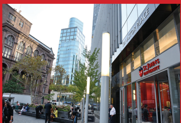
St. John's Manhattan Campus

Second Language (ESL) training at the University's Language Connection program, the Law School's American Legal English Program or the ALDA Program is recommended to help students achieve an adequate level of proficiency.